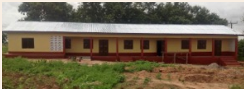
Nagboo - New School 2016