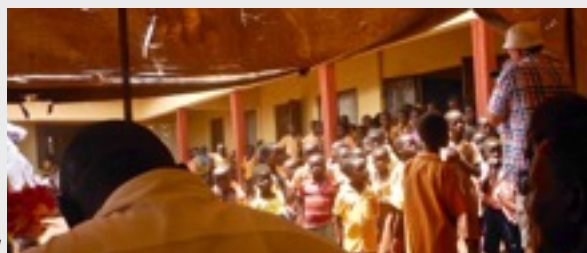
Kokpeng - Durbar in New School 2016

"Pupils can now study all year round whatever the weather, enrolment increased from 131 to 300 and it is easier to attract good teachers. The school is a dream come true. The school is a treasure that we will protect with all our might."