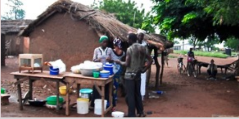
A Thriving Business

As everywhere in our region, women are the workers - the men generally take little responsibility for supplying food. The women use the loans to buy quality seed and to avoid selling too early after harvest when the prices are at their lowest. They trade in millet, ground-nuts and sometimes cassava and rice. Cassava is used to make Gari (a creamy white granular flour). When there is a good crop of shea nuts they will prepare shea butter, for which there is a good market.