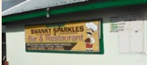
Walewale - Former Students' Restaurant

Last year's newsletter described our "in-house" Vocational School teacher training. This year we developed a new practice of bringing together teachers and students. This participative innovative approach is very successful: students provide comment/feedback and ask questions and teachers feel more valued and more determined.