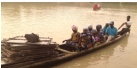
Kubori - Windows & Doors - by Canoe

Funded directly by WULUGU this project was supported by the local community and the PTA. Kubori is in the remote 'Overseas' area: during heavy rains it is cut off from the rest of the region hence its name 'Overseas'. Access is difficult - our metal windows and doors were transported by canoe (see picture). There are ten teachers who work closely with an active PTA. The school is thriving with 568 pupils (285 girls 283 boys). Transition to Junior High is good: in the next academic year it is expected that 63 will do this.