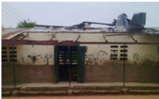
Kubori - in Dilapidated Condition

We try to provide new educational buildings where there is no school. We also help with major renovation work. We always impress on the local community the need to maintain their schools, however, the very harsh weather, together with termite and other pest damage, shortens the life of most buildings: a building's life is around twelve years. Major renovation is often beyond the local communities resources and without WULUGU's help buildings would rapidly crumble and be left to collapse.