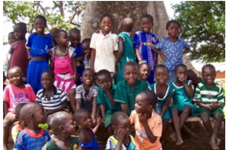
Happy Children at Murugu