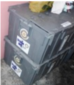
Trade Aid Boxes Ready for Opening at Sawla