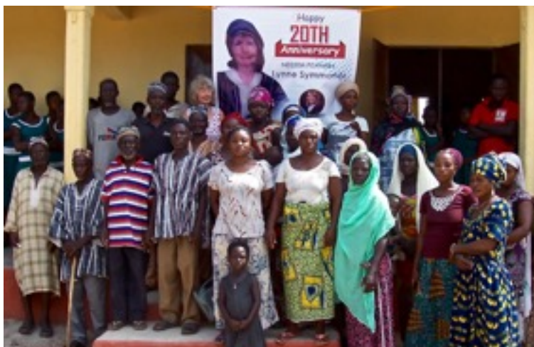
Parents & Teachers Kabampe