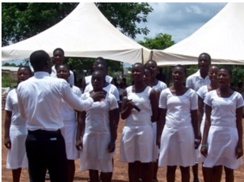
Durbar - Time for Singing & Dancing