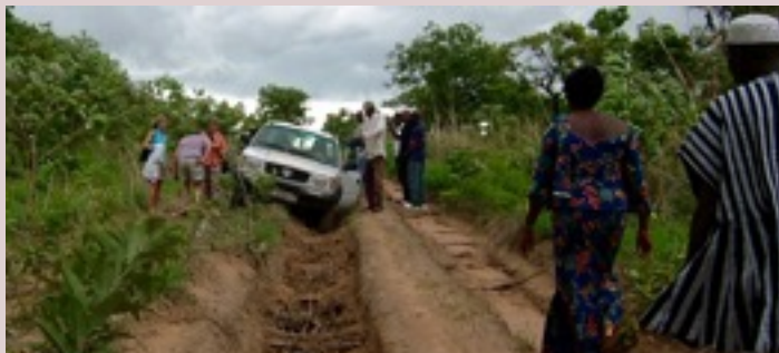
“Road” to Bawina