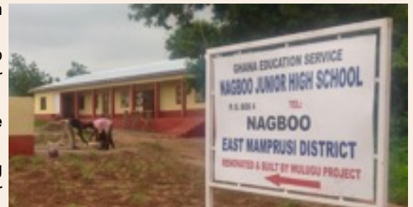
WULUGU New School at Nagboo (see page 5)

PS We have crammed as much news as possible into this newsletter - this has been a busy and exciting year for WULUGU!...there is much more we could say but space does not permit. For more information, including two short videos, please visit www.wulugu.co.uk