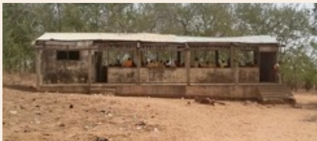
Nagboo - Old School 2016

Work commenced in March this year and was completed in mid-June at a cost of £26,000. The new work has provided three Junior High classrooms (to our new design with stronger metal doors and windows) together with a store/teacher room and toilets. This replaces an old, partly collapsed, two-roomed cage-like structure.