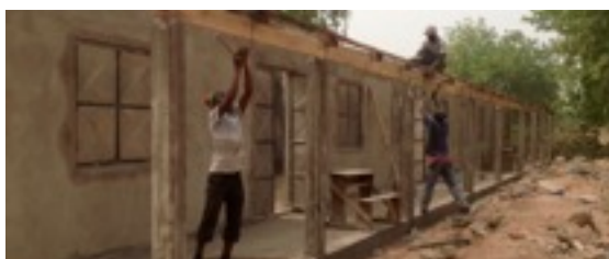
Kubori - Fitting New Metal Windows & Doors