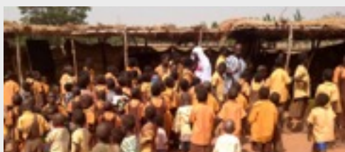
Kokpeng - Palm Leaf School 2015