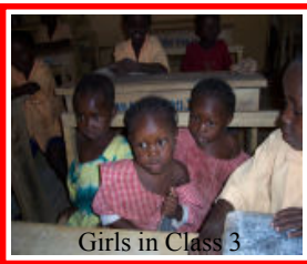
Girls in Class 3

But in Bowina the school building just could not cope so we have extended it by adding 4 new classrooms. The extension opened in September 2008. We are so grateful to the donors who so kindly made this dream a reality