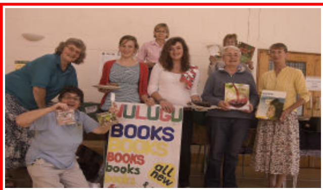
TABLE TOP SALE AT LITTLE MELTON

Following the success of last year's Table-Top Sale in Little Melton Village Hall, we held our second one on Saturday 27th September 2008. We kept the same format as the first, inviting local charities and local representatives of national charities to hire tables for the morning, from which to sell their wares and promote their organisation.