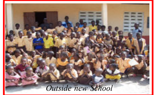
Outside new School

However, the children are more than the school can contain, hence the application by the people for extra classrooms. As earlier indicated Bowina school now has 9 teachers and 349 pupils with over 200 turned away. This is as a result of the provision of the school and teachers quarters by Wulugu Project'