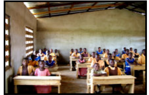
New classroom at Gbani

In July 2008 we received the really bad news that, in a storm, the new 'wriggly tin' roof on half the school had ripped itself out of the wall, blown off and landed across the other building .