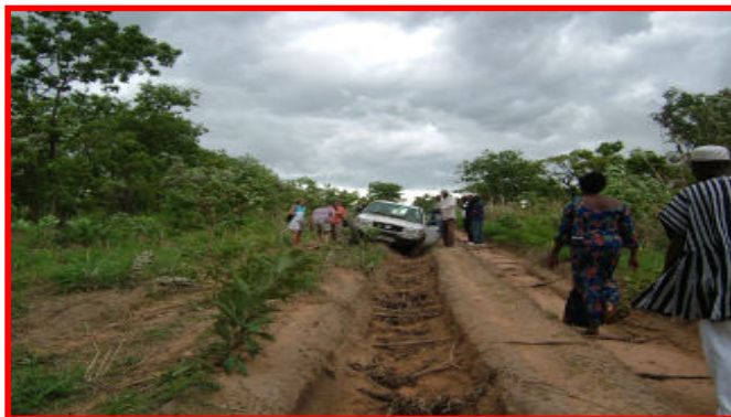
The road to Bowina

Bowina , our most remote primary school, is two hours on a graded road to the White Volta River, a quarter of a mile across in an open canoe into Daboya (capital of the West Gonja District), and 18 miles, or an hour and half, on a very rough track by tractor or 4WD if you are lucky.