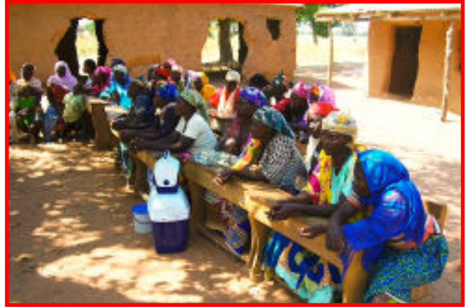
A group of women at Sayoo who have received income generating loans

When the loans are given they have three months grace period. They start paying in the fourth month. They take ten month to pay with a small interest of 5%" Karimu Nachina -Our man in Ghana!