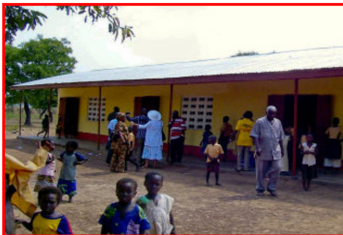
A generous donation from the 'Kitchen Table Charities Trust' helps us to transform two dilapidated schools

On 27th November we (Lynne) drove to Yapala to see one of the two schools we had re-roofed and re-built. This was quite splendid, with great kids and teachers. There was still no room for the kindergarden so they have 'Wulugu' dual desks under the trees! We gave them a football kit and a football. This village is totally neglected. They are so pleased with our help. The women came out to meet us—they had a long wait as this visit was in the middle of a very packed day for us. This is a photo where the old building is in the background. The contrast with the new one is considerable!